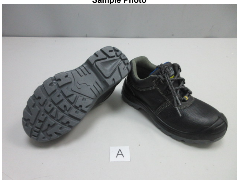
Product information is provided by applicant without verification or authentication of the brand.