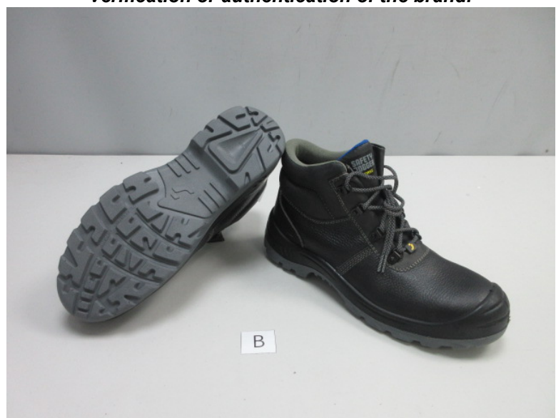
Product information is provided by applicant without verification or authentication of the brand.