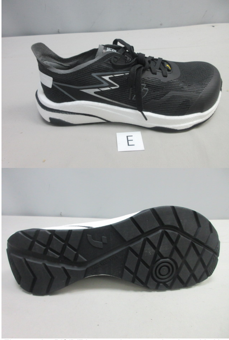
The samples B/C/D/E have not been tested and provided by the client for reference only